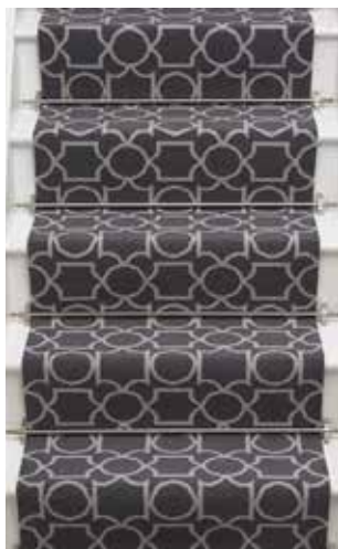
ALH0017 Earl Grey