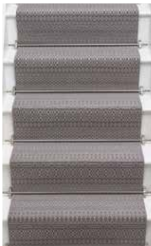
ZAN0016 Mouse Grey