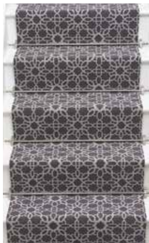
MAR0017 Earl Grey