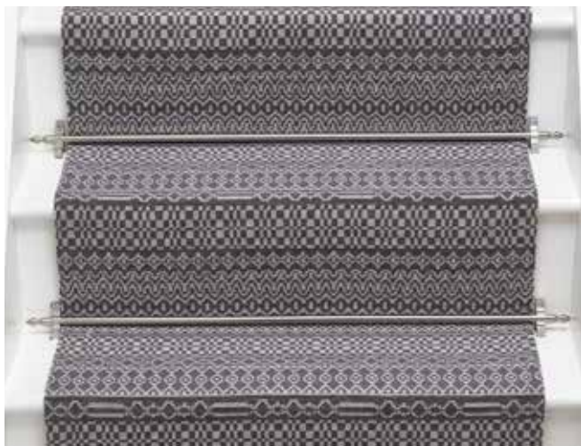
ZAN0017 Earl Grey