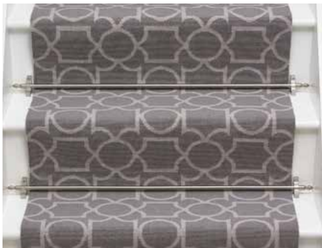
ALH0016 Mouse Grey