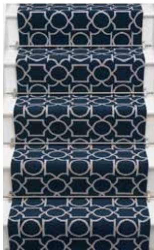
ALH0030 Marina Blue