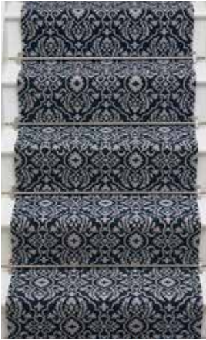
VER0030 Marina Blue