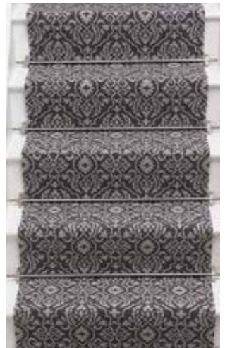
VER0017 Earl Grey