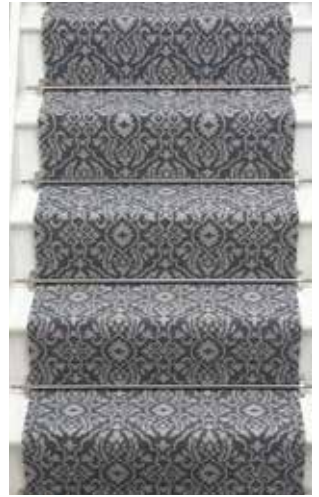
VER0034 Scandi Grey