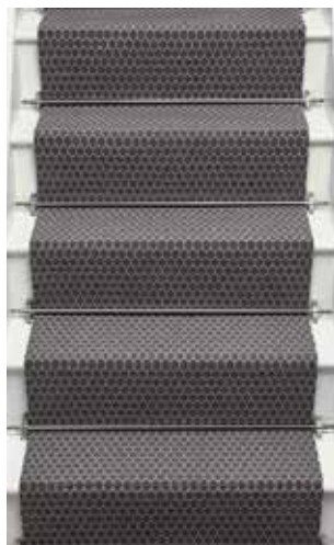
CHE0017 Earl Grey