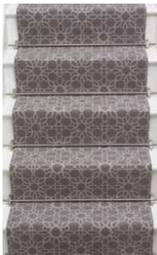
MAR0016 Mouse Grey