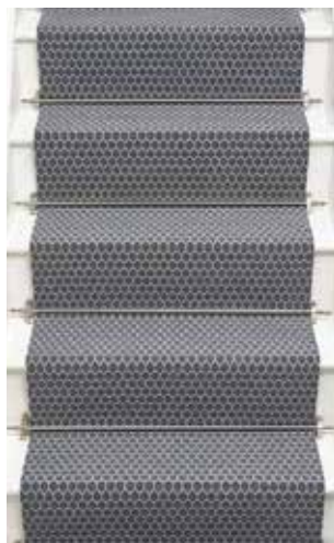
CHE0034 Scandi Grey