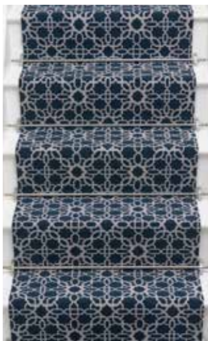
MAR0030 Marina Blue