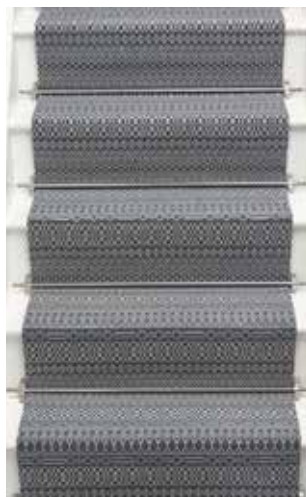
ZAN0034 Scandi Grey