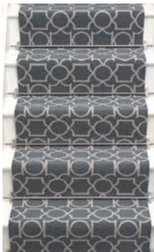
ALH0034 Scandi Grey