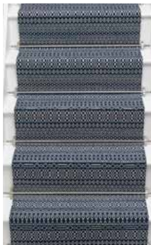
ZAN0030 Marina Blue