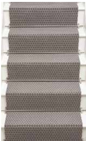
CHE0016 Mouse Grey