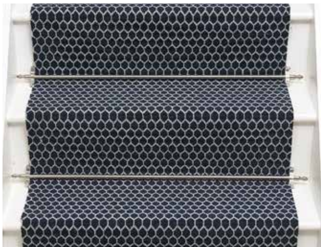
CHE0030 Marina Blue