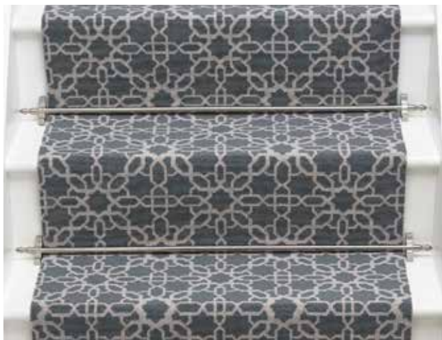
MAR0034 Scandi Grey