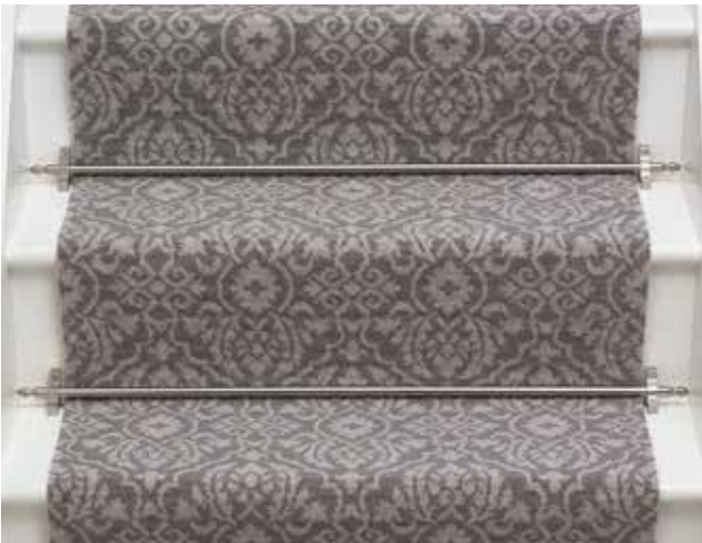
VER0016 Mouse Grey